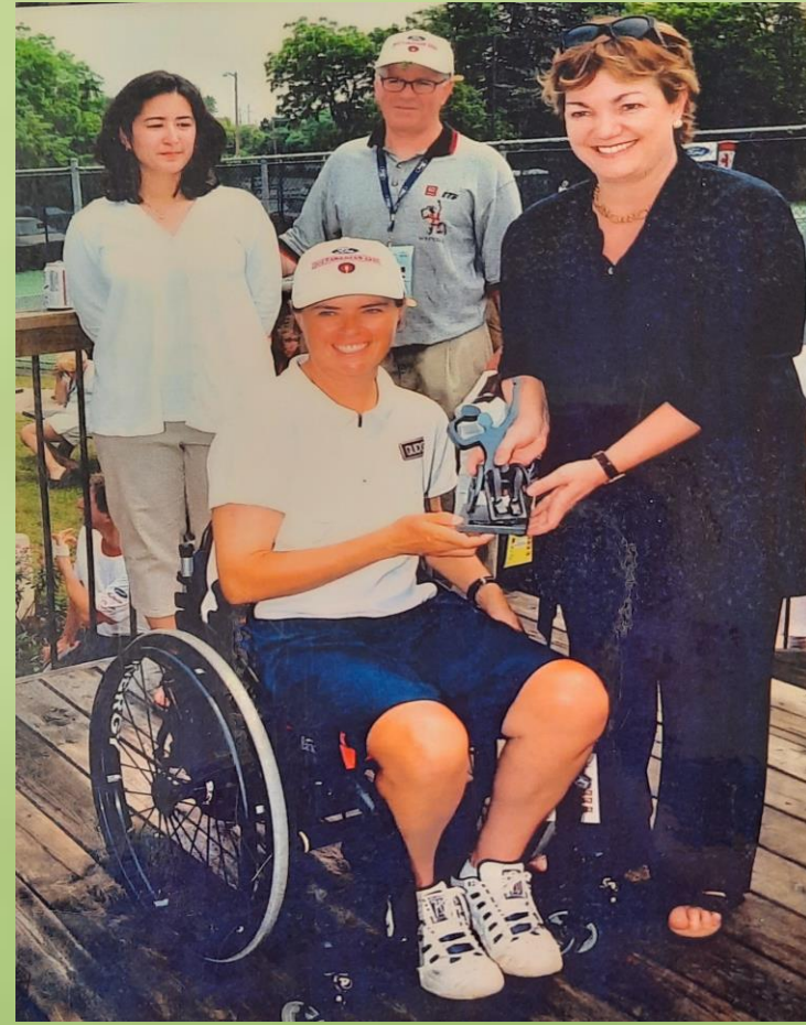
Sheila Copps attending a tournament in 2000