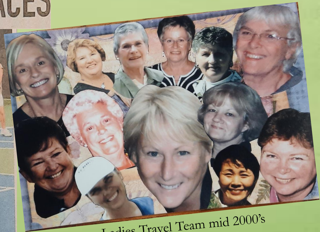
Ladies Travel Team mid 2000's

"I like the colour and they did a good job on the lines, although I think the baselines should be further back," he laughed. "Tennis is a great sport. It keeps you active, healthy and fit."