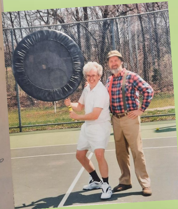
Rick Green (Bill Smith) and Steve Smith (Red Green) May 2, 1996

To the Stony Creek Tennis Club, Play Safe + Heal Fast! Rick Green "Bill" Red Green Keep 'em Still in the Sun May 2/96