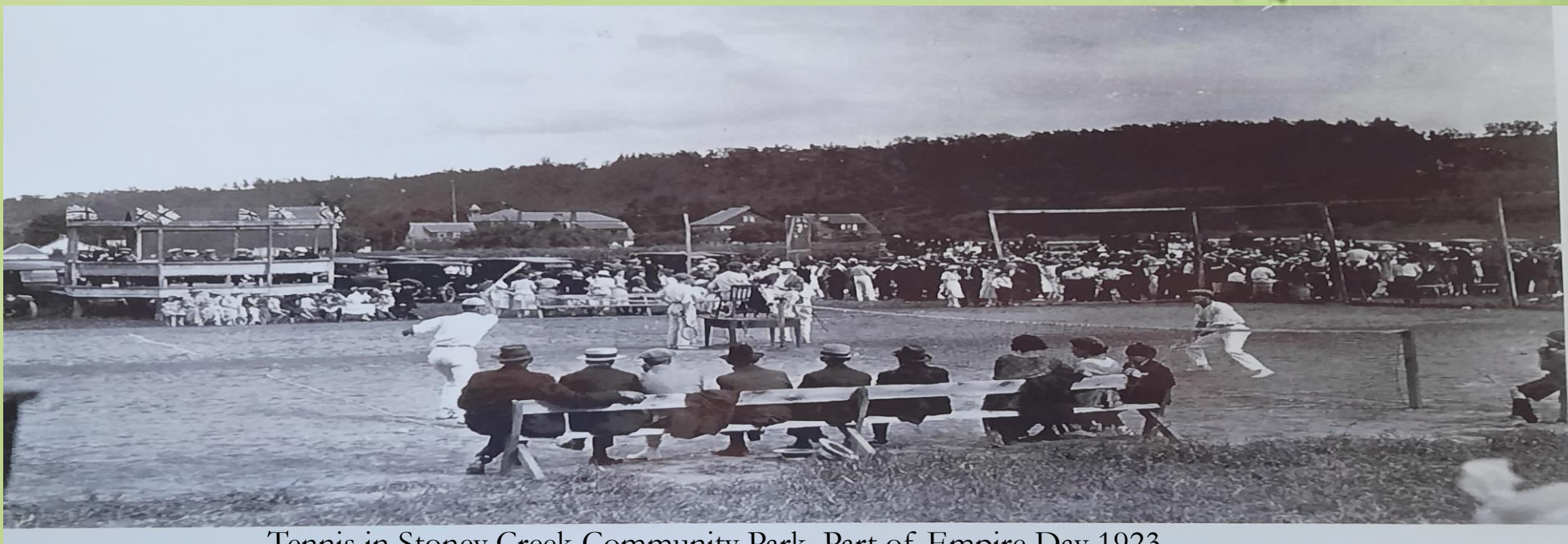
Tennis in Stoney Creek Community Park, Part of Empire Day 1923